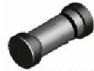
SURFACE MOUNT LL-41