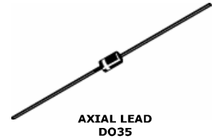
AXIAL LEAD DO35